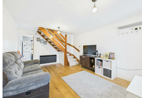
Living Room 11'9" x 15'8" (3.59m x 4.78m)